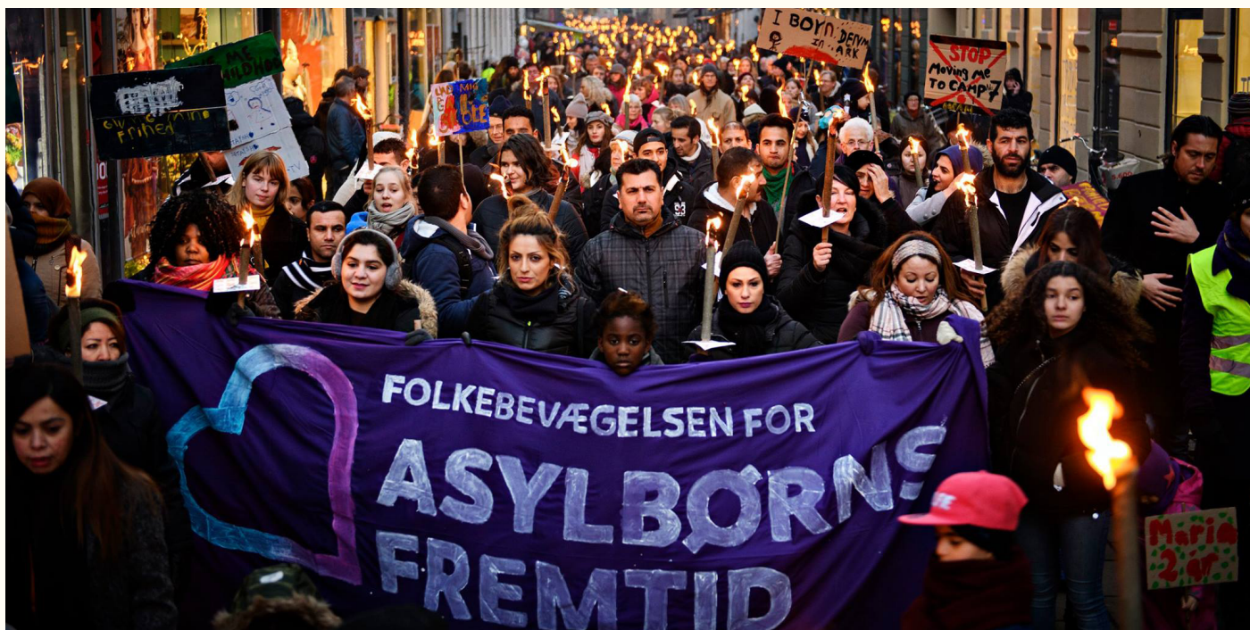
Torch light march for asylum-seeking children's future on December 16, 2017.